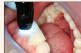
Light cure or self cure.