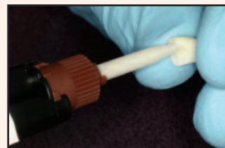
Dispense Breeze® Cement directly into restoration.